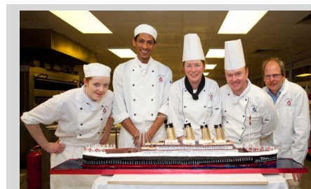
Students and staff with a replica of the Titanic, made entirely from pastillage, at the Titanic Commemorative Dinner in aid of Galway RNLI