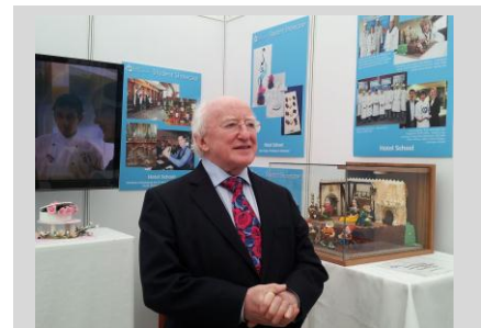
President Michael D Higgins at the Hotel School section of the GMIT Student Showcase pavilion

It was a fantastic opportunity for GMIT students to showcase their work to a world-wide audience of industry representatives and visitors to Galway, as there were over 900,000 visits by spectators and tourists to the Race Village and Global Village during the nine day event.