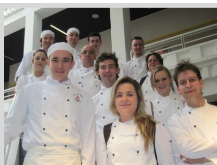
The 12 culinary arts students in Lycée Hôtelier de La Rochelle, France in March