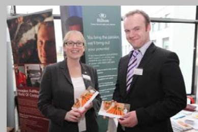
Hilton Hotels, UK & Ireland