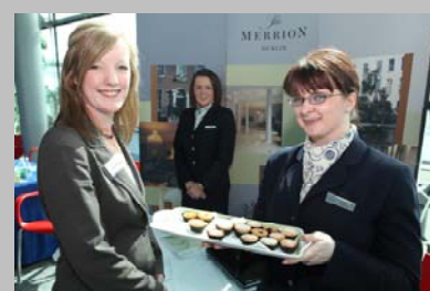
The Merrion Hotel, Dublin