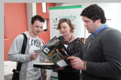
Irish Pubs Global