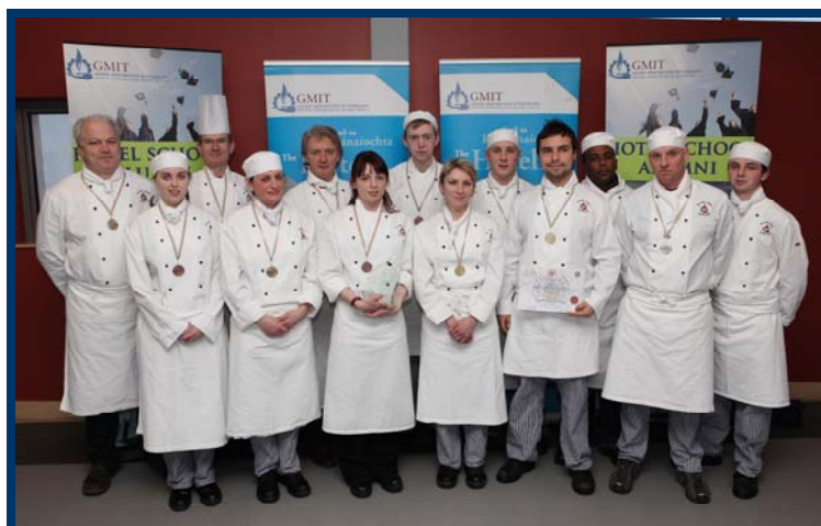
GMIT student chefs – winners of 24 awards at CATEX 2011 (see page 3)