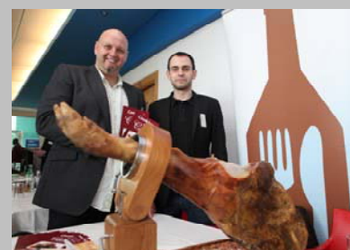
Cava Restaurant, Galway